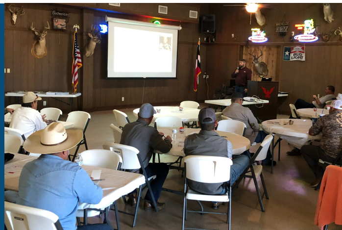
Deer Seminar with deer producers in Duval