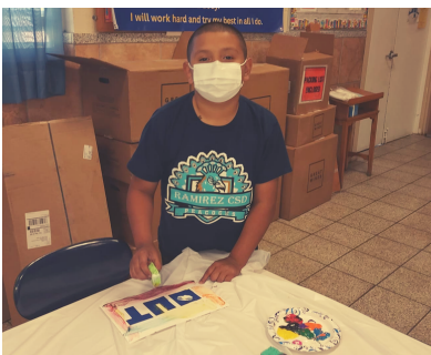
Mindful SELF at Ramirez CSD , student stomps "OUT" negative thoughts for better self regulation.