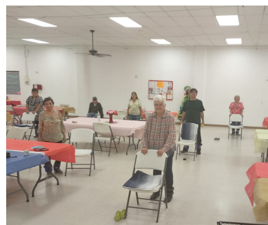
Strong People, Strong Bodies and Step Up, Scale Down at Benavides Civic Center , these ladies and gentleman are always up for the challenge!