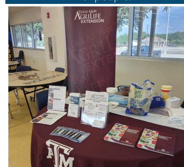
Dinner Tonight - Emergency Preparedness at Freer ISD ACE - Taste of Freer Event