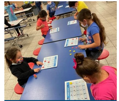
Walk Across Texas at Ramirez CSD , students participation in Fitness Bingo to help reach their mile goal.