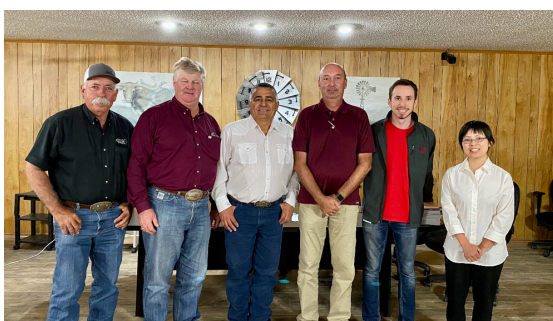
Water Welling Testing in Duval County