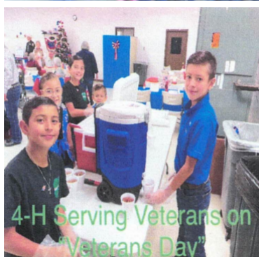
4-H Serving Veterans on "Veterans Day"