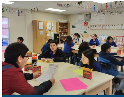
Mindful SELF at BJH in San Diego , student discuss appropriate responses to conflict.