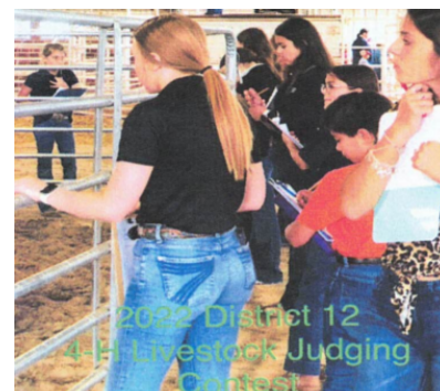
2022 District 12 4-H Livestock Judging Contest