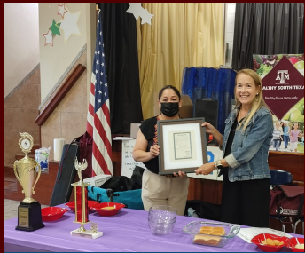
Dinner Tonight JR at Ramirez CSD