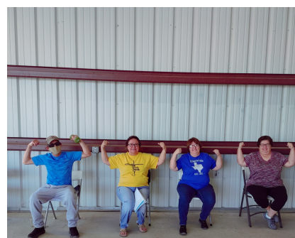
Strong People, Strong Bodies at the Freer Pavilion , energetic young group of people.