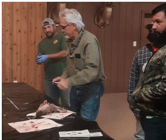
CWD Training with deer producers in Duval