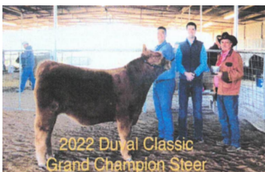
2022 Duval Classic Grand Champion Steer