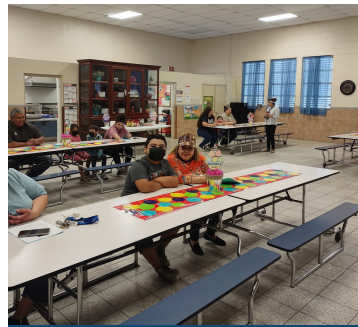
Dinner Tonight - Emergency Preparedness at Ramirez CSD