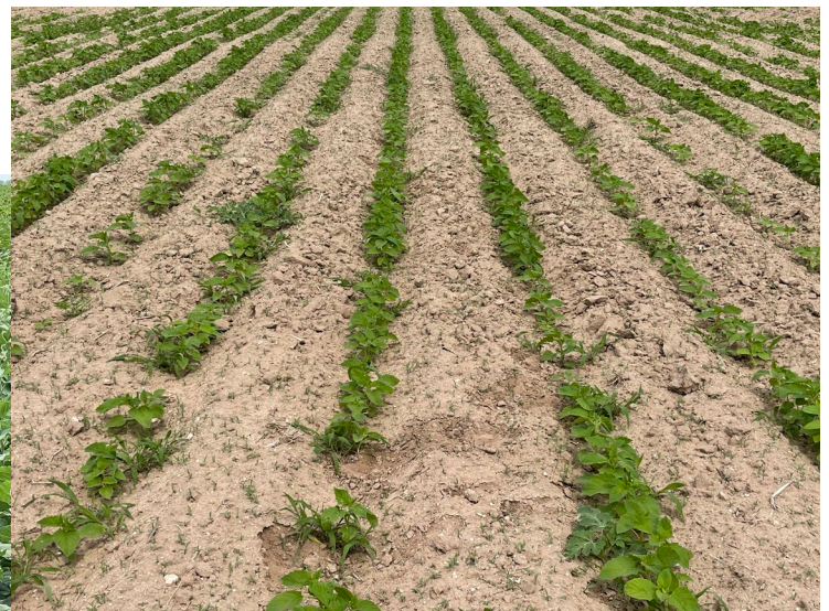
Figure 2: Sesame

*Join us on May 11 th at Weslaco Texas AgriLife auditorium for a “Cotton Scouting School” where we will go over cotton pests and diseases , as well as touching on pests in other row crops such as sorghum, and sesame. It will be a 2 hour program that starts at 2pm, ends at 4:30pm. 2 IPM CEUs will be available. See flyer attached in email.