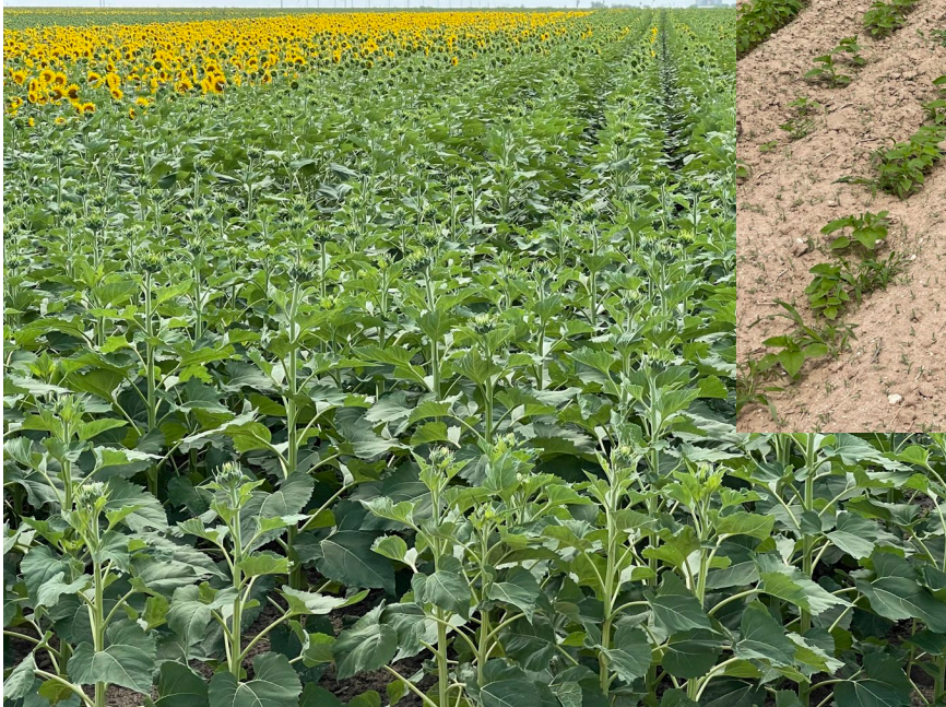
Figure 3: Sunflowers blooming in McCook, TX

We have young sesame in the early vegetative stages as stands have looked good and clean of pests so far along the river, in McCook, Lyford and other parts of the Valley. Sunflowers are almost blooming to full bloom out in the McCook area as there has been reports of growers spraying for Sunflower headmoth. The sunflowers looked very clean which is good as Sunflower moth infestations are usually heaviest when early planted fields bloom during May and June. Soybeans looking good as I was picking up on a little bit of cucumber beetle and soybean looper feeding on the leaves in some fields and seeing an occasional 3 cornered alfalfa hopper but not really seeing any alarming populations or causes for concern or treatment.