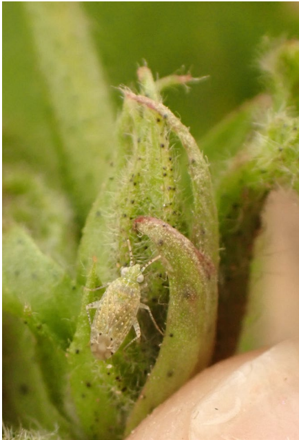
Figure 2: Adult fleahopper on squaring cotton

in the Monte Alto and Edcouch Elsa areas I came across just 2 adult fleahoppers. So heads up on scouting for fleahoppers next week in squaring cotton. Other than that, there was the occasional cotton aphids but again cotton looked pretty clean throughout valley this week.