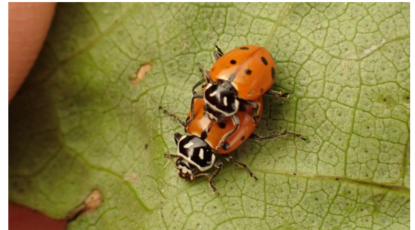
Figure 3: Ladybugs in the cotton

in the Monte Alto and Edcouch Elsa areas I came across just 2 adult fleahoppers. So heads up on scouting for fleahoppers next week in squaring cotton. Other than that, there was the occasional cotton aphids but again cotton looked pretty clean throughout valley this week.