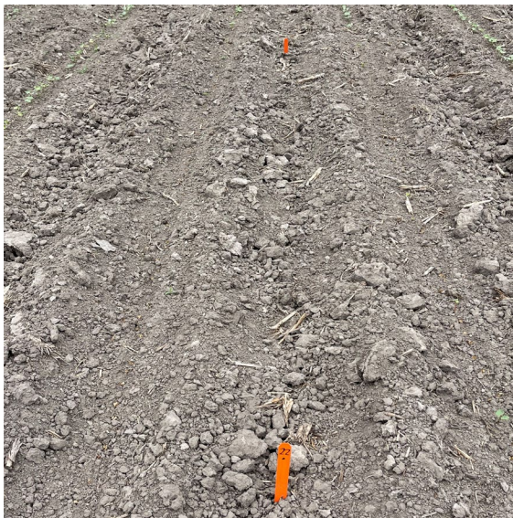
Figure 5: Dead cotyledon cotton in middle 2 rows from my plot 1 sprayed using Huskie at 19 fl oz/acre and NIS at 0.25%, you can't see any cause they're dead