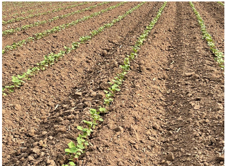
Figure 4: 6 true leaf cotton in La Feria