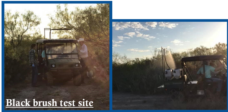
Black brush test site