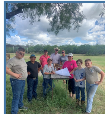
Shooting Sports/ Archery