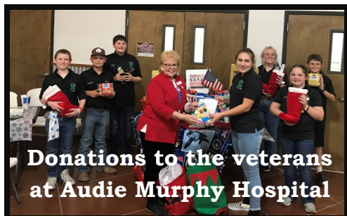
Donations to the veterans at Audie Murphy Hospital