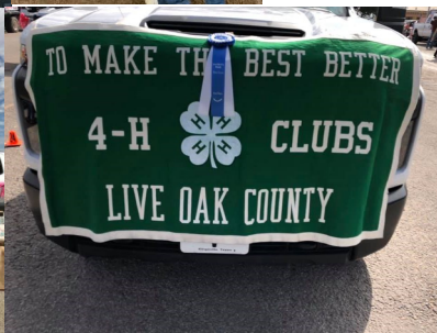
LOC Fair & Parade