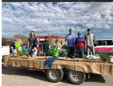
Promoted Gardening & Healthy Living by passing out 150 garden seed packets