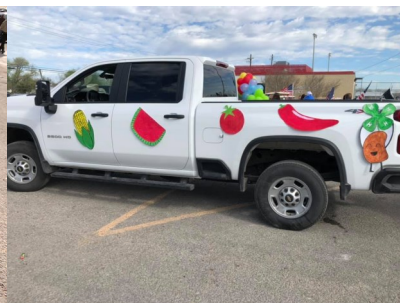
1st Place Youth Organization Float