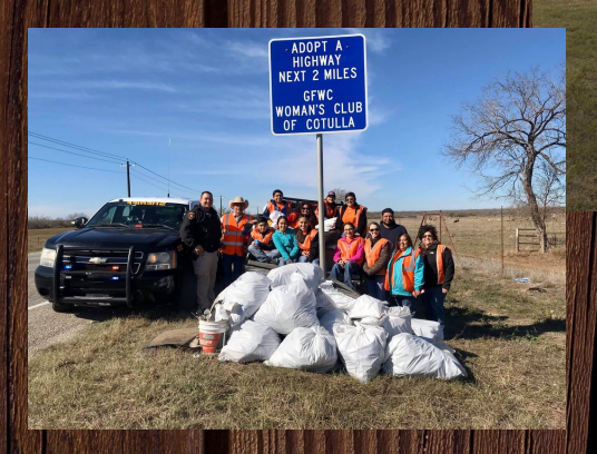
One Day Event: Picked up over 60 bags of trash off HWY97