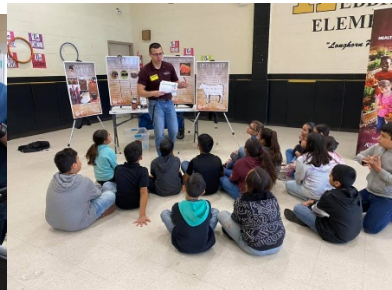
(L) Summer 2020, Walk Across Texas! Champions. (M) HST Campus Recognition JHCISD Schools (R) Path to the Plate Expo @ JHCISD