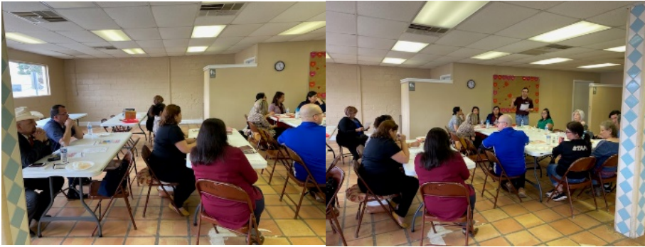
February 18, 2020. Healthy South Texas Coaliton Meeting.