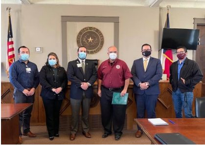
DEC. 18, Jim Hogg County Meeting w/Doctors Hospital of Laredo