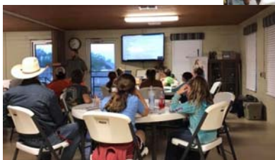
Hunters Education Course

Drunk/Distracted Driving Simulator to 75+ Jr High and High School students at MCISD