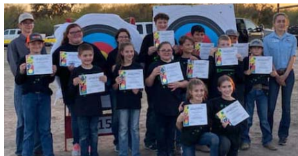
District 12 Archery Contest