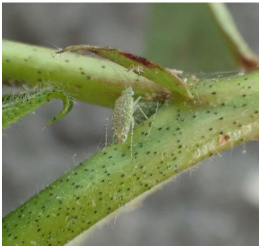
Figure 2: Adult fleahopper

(Figure 2) are a pale grey/green ghostly color about 1/8 inch long and move pretty quickly when you walk up on them while checking. Fleahopper nymphs (Figure 3) are a bright lime green color and you will find them at the growing point on your pinhead squares as they sometimes too are hard to spot but you will notice their erratic fast behavior. Fleahopper adults and nymphs like to feed on the