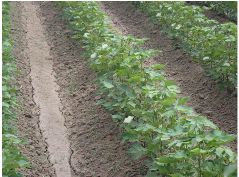
Figure 1: Cotton field in full bloom

This week in cotton saw many fields in full bloom and many fields are squaring nicely. There is some later planted cotton just barely putting on pinhead squares. Many fields of cotton were again being irrigated this week or are drying up from irrigation. Still seeing some heavy cotton aphid pressure on the younger cotton at 6 true leaves. Right now the main pest in cotton are fleahoppers as we saw an increase in pressure this week. Many cotton fields in Sebastian, Lyford, and Monte Alto areas had increase in fleahoppers (20-30%) as I picked up on many nymphs around those areas. In Raymondville, and Lasara I wasn't really seeing any fleahopper pressure, was pretty clean. In the Edinburg area I barely started to see maybe 5-10% fleahopper pressure mainly on cotton drying up from being irrigated. Cotton fleahopper adults