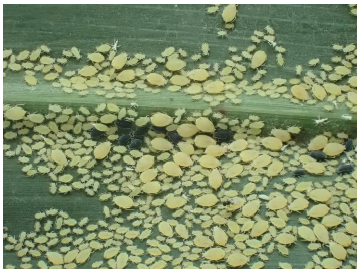
Figure 4: Sugarcane aphids and blue parasitized sugarcane aphids

Many fields with moderate to high sugarcane aphid pressure this week as I believe we are at its peak in the life cycle. If you have sorghum right now that is flowering or in soft dough stage and just irrigated you will need to make sure your sugarcane aphid pressure is low as we saw many fields throughout the valley experiencing high sugarcane aphid pressure. Some fields had very good build up of predators and didn't need to be sprayed but then there were other sorghum fields with a lot of glistening from sca feeding and too high of populations for predators to keep up, those fields will need to be sprayed. There are three products you can use to control SCA: Sivanto, Transform, and Sefina. All three have been proven to show good control when applied on sorghum for sugarcane aphid (SCA) pressure. Also building in sorghum this week was headworms. Saw many fields along the river and in the mid valley with 1 corn earworm per sorghum head. Many fields however were about 75% in hard dough stage but for those fields still mainly in soft dough stage you may need to check and spray for headworm pressure. We did notice midge pressure in the mid Valley mainly around Weslaco and Mercedes area in flowering sorghum but I didn't see many midge at all in the north part of the valley.