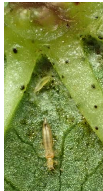
Figure 3: Thrip adult on bottom and thrip nymph on top

Cotton overall across the Valley was clean, seeing the same suspects as last week. Still picking up on light cotton aphid populations across the Valley, but I did hear of some cotton being treated for high aphid populations in the Mid Valley so be mindful of that. Also, aside from seeing high thrips populations along Military HWY this week same as last week, I was finding high thrips populations in La Feria cotton as well when I hadn't seen them there the week before. Thrips will sap juices with their piercing sucking mouth parts and the damage they cause on the underside of leaves will look silverish in color with a stippling effect. Thrips can dry out the leaves with their feeding and emerging seedlings in cotyledon stage can look very damage when you have high winds kicking up dust and sometimes cotton can become a loss. Only picked up on one fleahopper this week after checking several fields but will be looking diligently for them in the next weeks as cotton continues to mature quickly, and squaring will be upon us soon. Other than that cotton is looking pretty good.