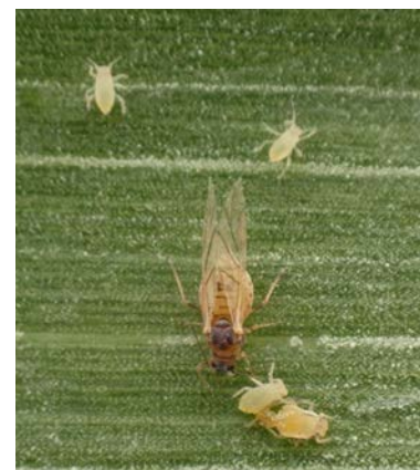
Figure 4: Pregnant alate (winged SCA) with SCA nymphs (babies, 4 of them)