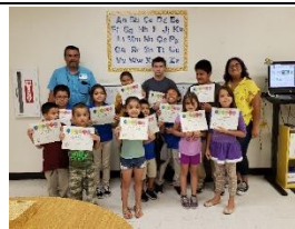
Character Ed Graduation at Housing Authority