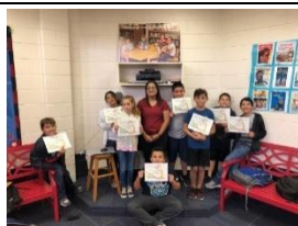
Barn Owl Pellet Graduation in Sarita