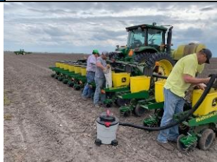
Establishing cotton demonstration plot