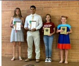
4-H Awards Banquet