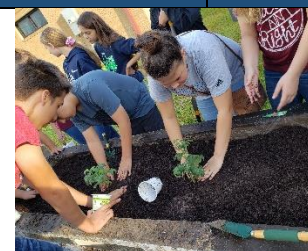
Learn, Grow, Eat & Go! at Ricardo Elementary