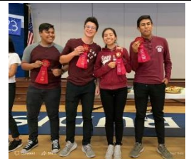
County Food Show/ Food Challenge Contests