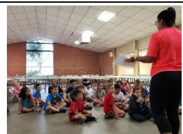
Drug, Alcohol & Bullying Prevention at Summer Camp