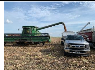
Harvesting grain sorghum variety demonstration plot