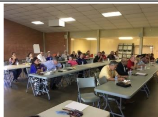
Residents/ stakeholders address issues at 2019 TCFF