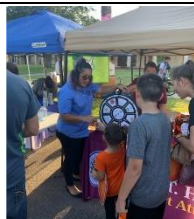
National Night Out Outreach