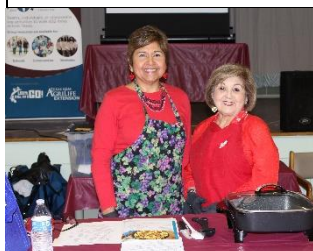
Dinner Tonight at Weavers of Love