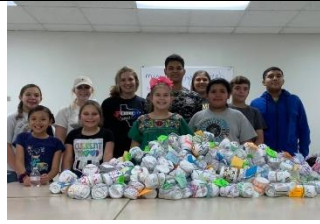
Sock-tober Fest Community Service Activity