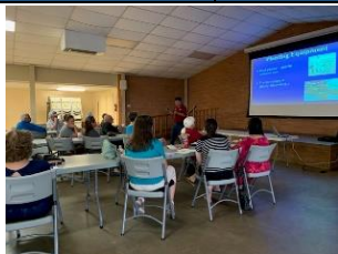
Fall vegetable garden workshop