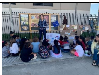
Path to the Plate Youth Expo