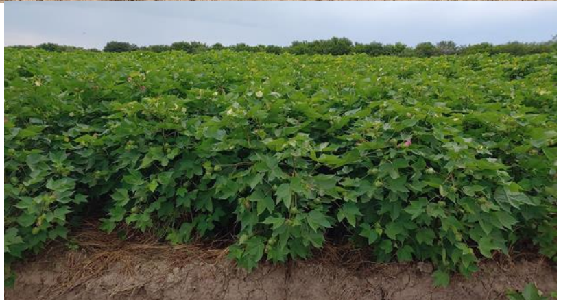
Figure 1: Various pictures of Cotton in different stages throughout the Valley