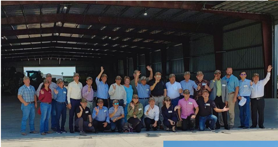
Figure 3: Textile Association of Indonesia visiting the LRGV