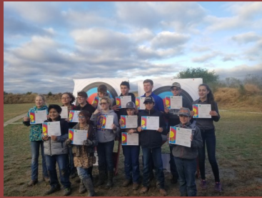
District 12 Archery Match

Opportunity for Livestock Exhibitors to learn more about their Livestock Species at this one day clinic, that taught youth about livestock selection, feeding, fitting, general livestock husbandry, as well as showing character in the show ring. 27 individuals were present for this event including parents and youth. Of the group, all youth were able to learn in the classroom about showmanship, and work their livestock projects in the show ring to gain valuable practice and critiques from the presenters. Through our evaluation strategies, 90% of the youth found the value in realizing that proper showmanship can assist you in placing higher; 100% realized that utilizing proper equipment, along with being calm and patient is the key to working livestock, and 100% were able to understand that showing