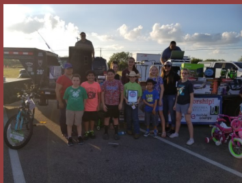
One Day 4-H