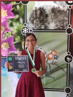
District 12 Roundup