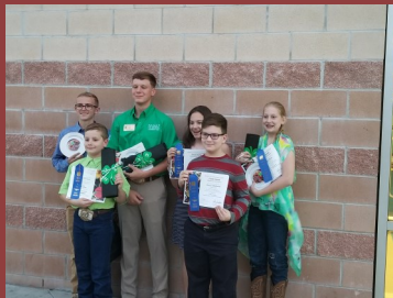
District 12 Food Show