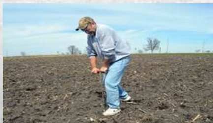
Coastal Bend Soil Sampling Campaign (Multi-County)