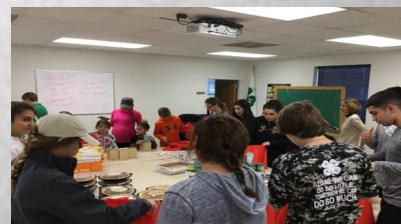
Members providing Thanksgiving meals to less fortunate families