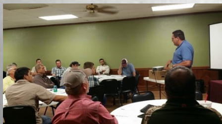
South Texas Cotton and Grain Association talking about legislative issues