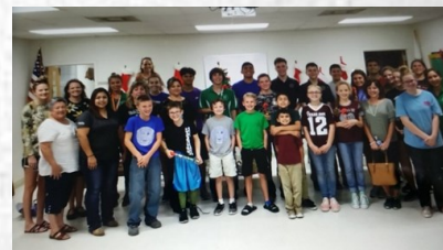
4-H families participating in scavenger hunt food drive during the holidays