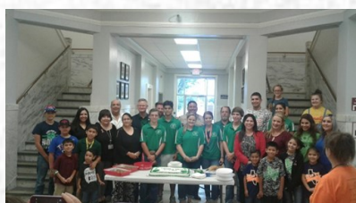
National 4-H Week Proclamation by Kleberg County Commissioners Court