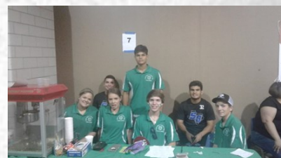
4-H Council officers promoting program at National Night Out