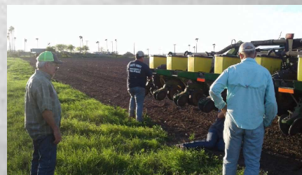
Cooperators working with Extension on demonstration trials