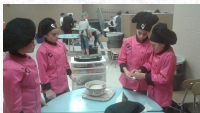
Food Challenge members learn through team work about food and nutrition