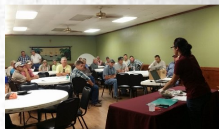
Healthy South Texas food demonstrate during Annual Crop Tour in utilizing grain sorghum flour and cottonseed oil