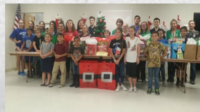
Members donating gifts to Foster Kids