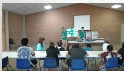
Members conducting "Role of an Officer and Parliamentary Procedure"