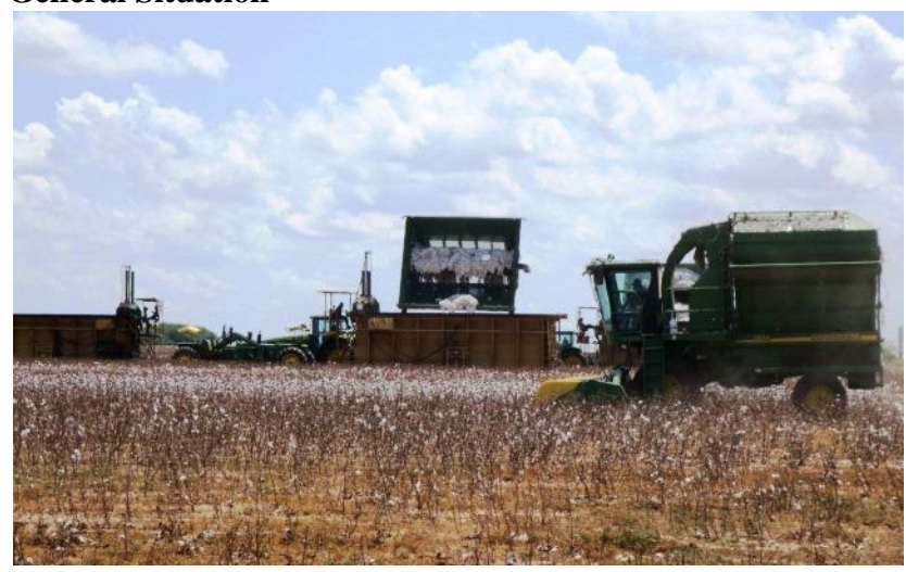
Figure 1: Cotton being harvested, and modules being made in background

Mainly the only pest pressure I am seeing is whiteflies. There are so many whiteflies that many growers and consultants have experienced seeing them move from one area to another this week. During this time of defoliation whiteflies will either migrate to another nearby cotton field not being defoliated yet or they will seek refuge in nearby citrus, sunflowers, cabbage, and just about any other crop they can find some shelter and food in nearby. Growers with cotton along the river are experiencing this the most as some open cotton has lint stained from the sooty mold that can occur if whitefly populations get out of hand. I have some growers that are putting one last irrigation on their cotton to help mature out the top of the canopy. Those growers should really be on top of whiteflies or spray prior to irrigation to avoid stained cotton as the whiteflies continue to migrate out of fields being defoliated.