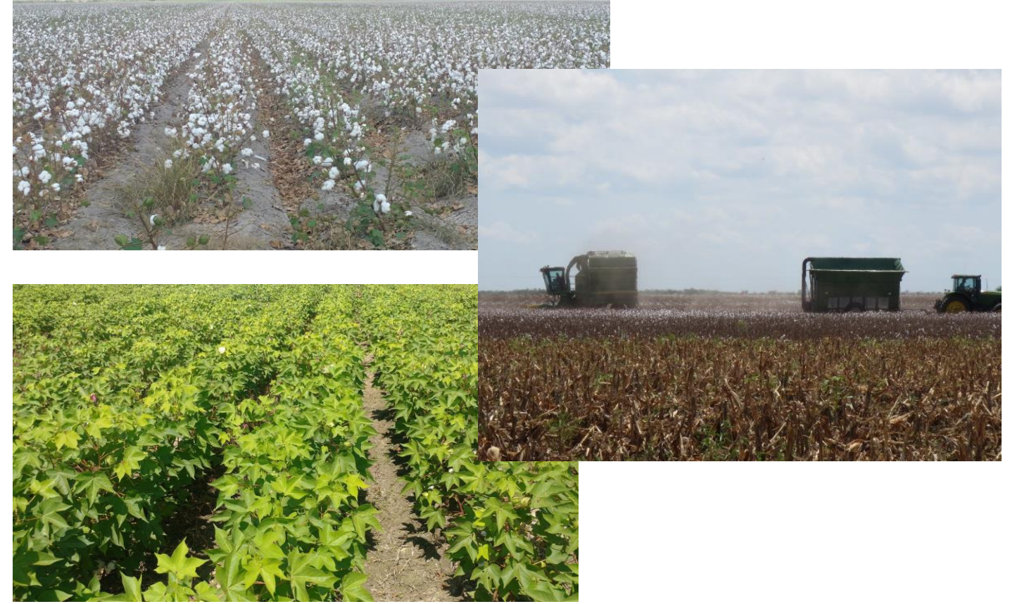
Educational programs of the Texas AgriLife Extension Service are open to all people without regard to race, color, sex, disability, religion, age, or national origin. The Texas A&M University System, U.S. Department of Agriculture, and the County Commissioners Courts of Texas Cooperating.