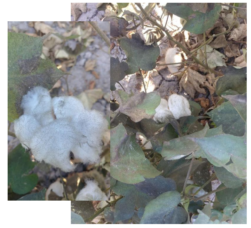
Figure 2: Cotton stained from sooty mold due to heavy whitefly pressure