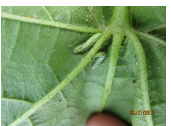
Syrhid fly larvae

per hundred plants on older cotton and at 8-10 per hundred plants on younger cotton have been seen.