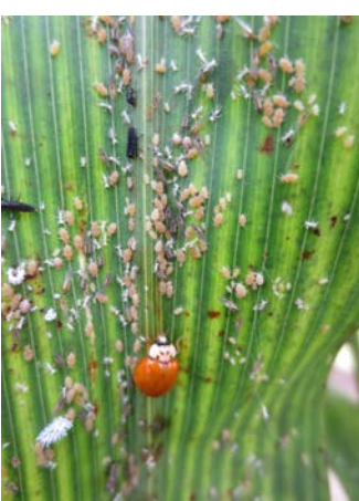
Figure 6: Predators feeding