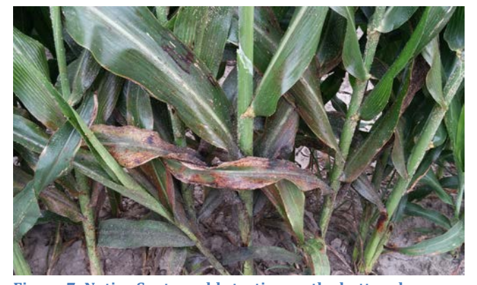
Figure 7: Notice Sooty mold starting on the bottom leaves from heavy sugarcane aphid infestation.