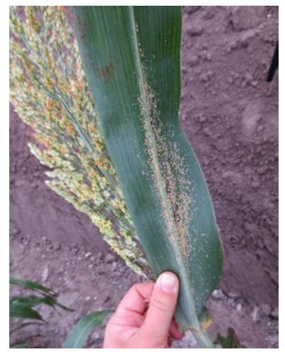
Figure 2: Infestation of sugarcane aphids on the flag leaf

sugarcane aphid is colonizing, and distributing itself amongst other sorghum fields in the area and populating them. Other observations were that the sugarcane aphids where starting to populate the flag leaves (See figure 2) in grain sorghum. Many alates were noticed in the flag leaves and leads us to infer the sugarcane aphid can be migrating to the sorghum head. This week, I also noticed a sorghum field with a heavy sugarcane aphid infestation, there the sugarcane aphids where on the sorghum head (See figure 3, 4, and 5). There are also many predators such as lacewing eggs, syrid larvae, well-known ladybug larvae, and other not very common such as and scyymus (whitish ladybug larvae) and stethorus (tiny black larvae) being observed in the sorghum but the populations of sugarcane aphids grows so rapidly that they cannot keep up with the task of controlling them (Fig 6). Usually upon finding these predators feeding on the sugarcane aphids it can be an indicator that there is a bad infestation and that a spray is necessary.