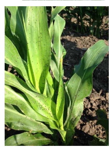
Corn leaf aphid infestation

Sugarcane aphids have been reported in fields in the Mission and Rio Hondo area that are at 1-2 % infestation level in sorghum planted in mid-February. Older sorghum planted the first of February was already seeing a 4% infestation level in some fields in the Rio Hondo area. Most fields that we are surveying are seeing some sugarcane aphid activity but none warrant a spray treatment yet. This is a new pest of sorghum,