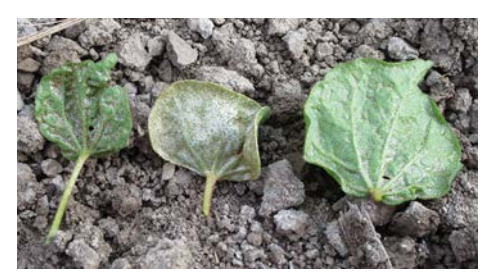
Thrip damage on cotton leaves

So far cotton acreage in the Valley is at 62,000 acres roughly and is expected to rise as there is still some cotton being planted this week. If so the acreage might reach 70,000 according to the Bollweevil Eradication Foundation. The majority of cotton planted is at seedling stage, or 4 to 5 true leaf stage. Some cotton planted back in February has 6-9 true leaves and has started to square. Dryland producers in Willacy county and parts of Cameron have yet to see their cotton come up.