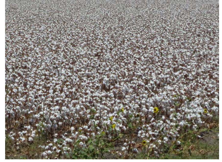
Harvested cotton modules and bales above and bottom picture is cotton ready to be harvested.