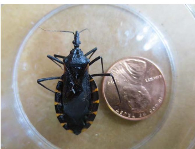
Kissing bug I found on my porch, Triatoma gerstaeckeri