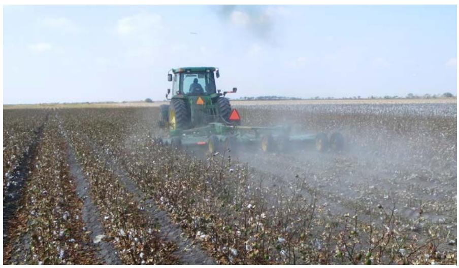
Cotton stalks being destroyed above, cotton stalks completely destroyed below.

As the September 1<sup>st</sup> deadline approaches it is important to practice timely good stalk destruction. It has been proven that stalk destruction is key to controlling boll weevil populations in the effort to disrupt their life cycles to avoid overwintering. Cotton stalks should be either completely plowed down or shredded down to 6-8 inches in height. Standing cotton stalks should be sprayed with label approved herbicides at least within 7 days after harvest for good control to avoid any regrowth. Regrowth is a big problem with the warm weather and late summer rains we have in the Valley. Waiting until 60% to 70% of the bolls are open can help reduce the amount of cotton regrowth you will see in your fields. Plus you do not want to apply your harvest aid chemicals too early because it has be shown that premature crop termination can reduce lint yield, seed quality, micronaire, and fiber strength. However everyone is