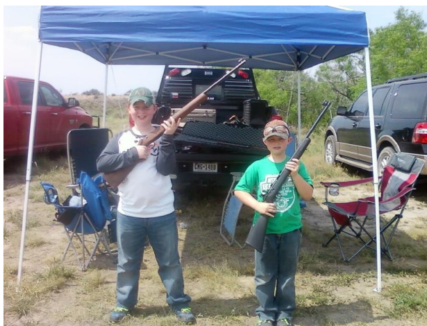
District 12 4-H Rifle Match participants