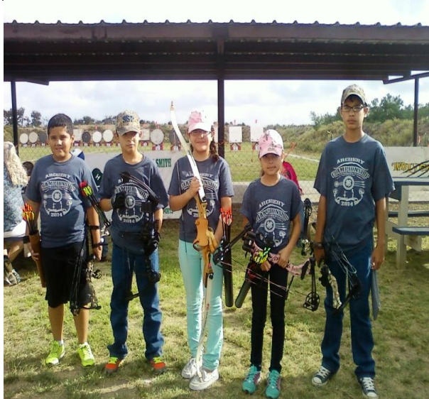
District 12 4-H Archery 3D Match participants