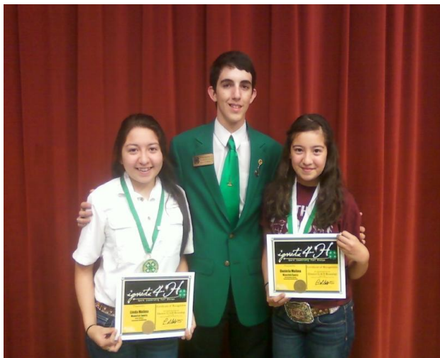
District 12 4-H Entomology two 1 st Places