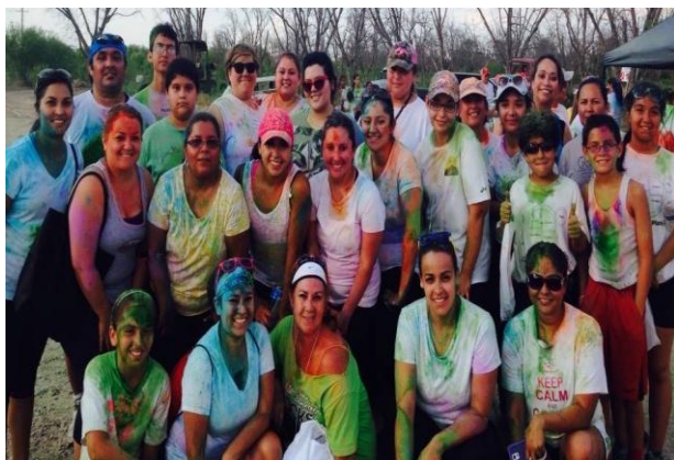
Colors 5K run at Kickapoo Reservation