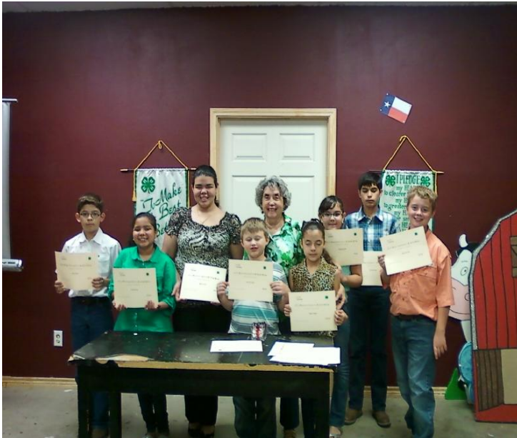
District 12 4-H Food Show participants