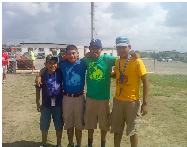
Leadership LAB participants