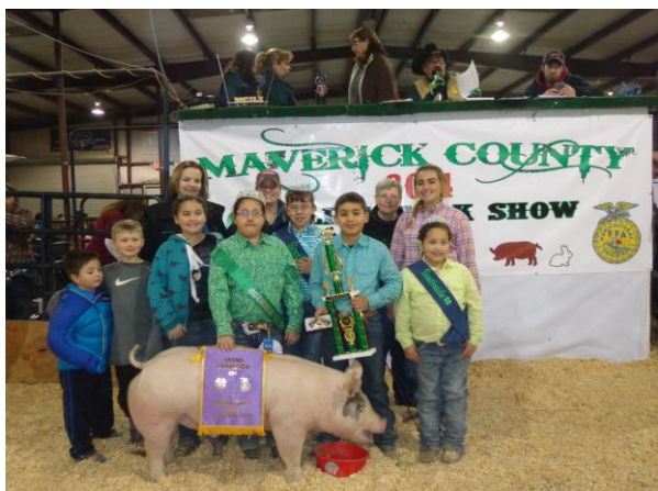
Hog Grand Champion a 4-H Kid