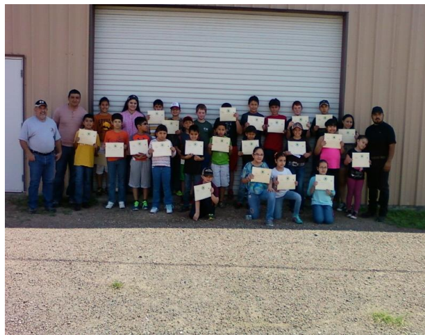
4-H Shooting Sports Safety Training