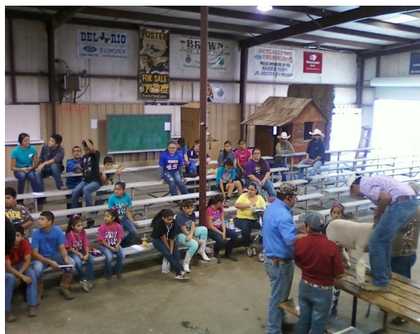
Lamb and Goat Clinic