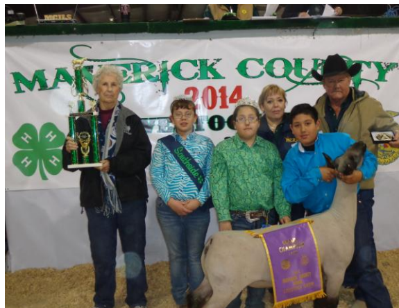
Lamb Grand Champion a 4-H Kid