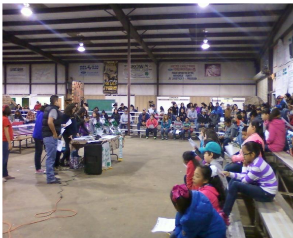
The Eagle Pass 4-H Club