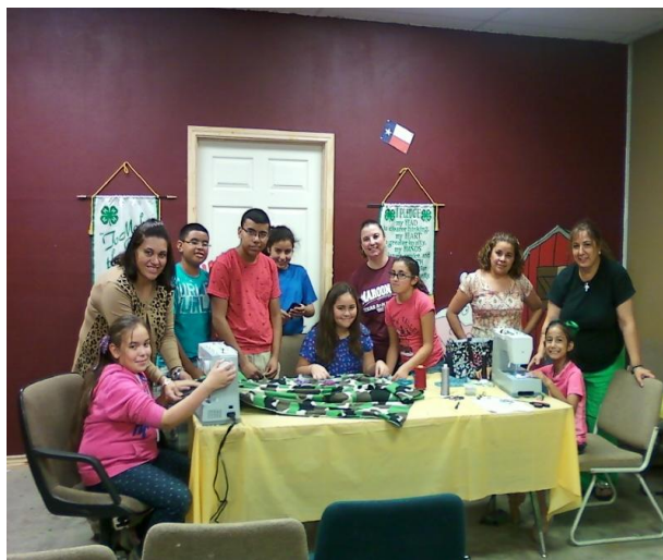
Eagle Pass 4-H Club Sewing Clinic