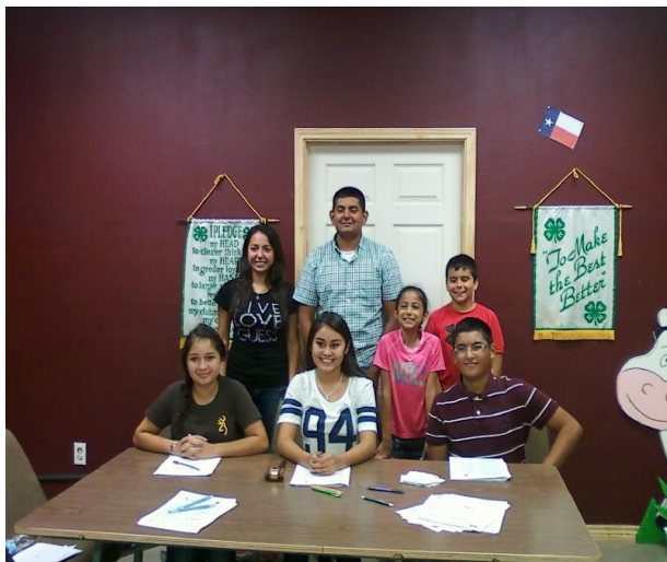
2014 Maverick County 4-H Council