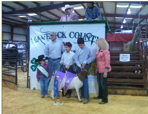
2013 Goat Grand Champion and a 4-H member