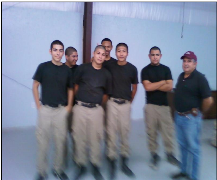
Maverick County Border Hope Boot Camp