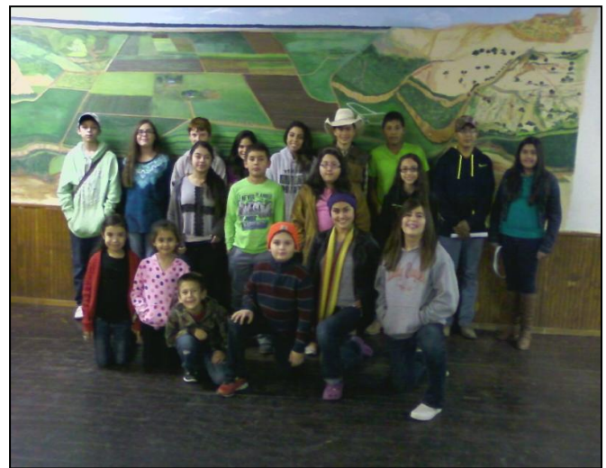
The Quemado 4-H Club