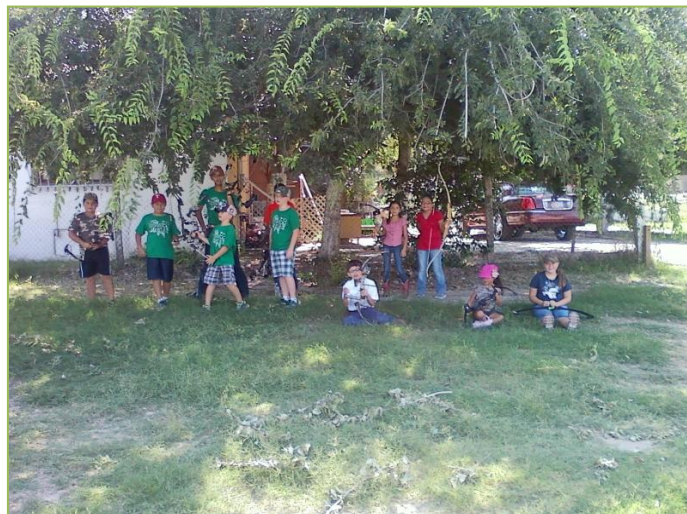
Part of the Maverick County 4-H Archery Project