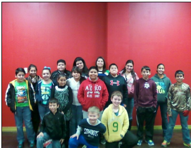
The Riverside 4-H Club