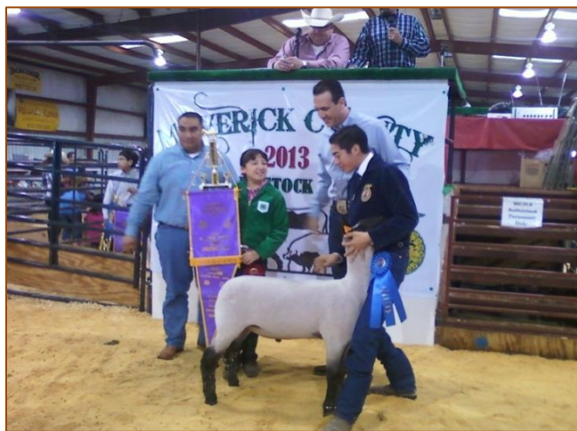
2013 Lamb Grand Champion and a 4-H member