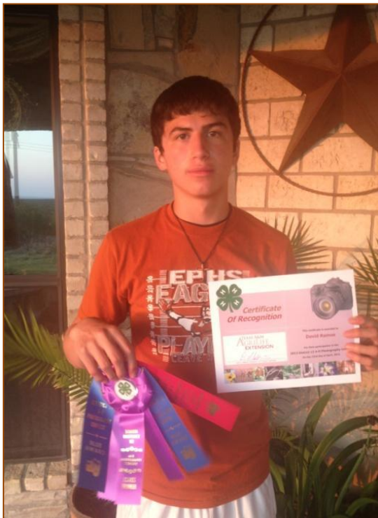
State 4-H Photography Contestant

The Maverick County 4-H Photography Show Project is an event in which the Adult Leaders and the County Extension Office organize on a yearly basis. We would like to increase the number of participants, besides the 4-H members that do it every year.