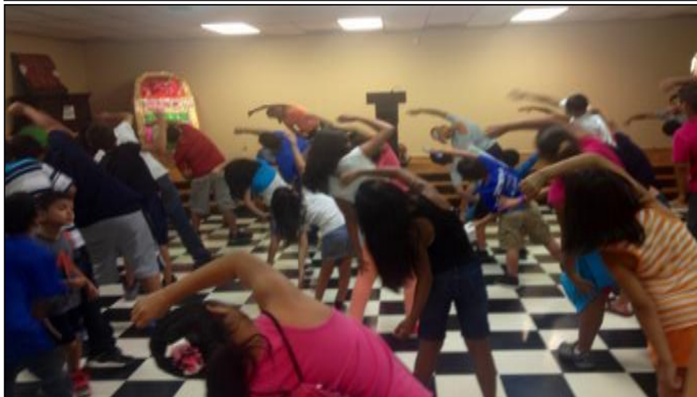
2013 Maverick County Live It! Real Life Nutrition for Teens Nutrition and Exercise Program