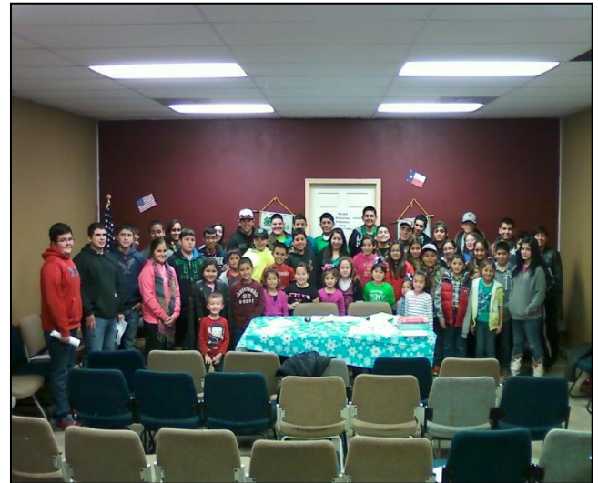
The South Side 4-H Club