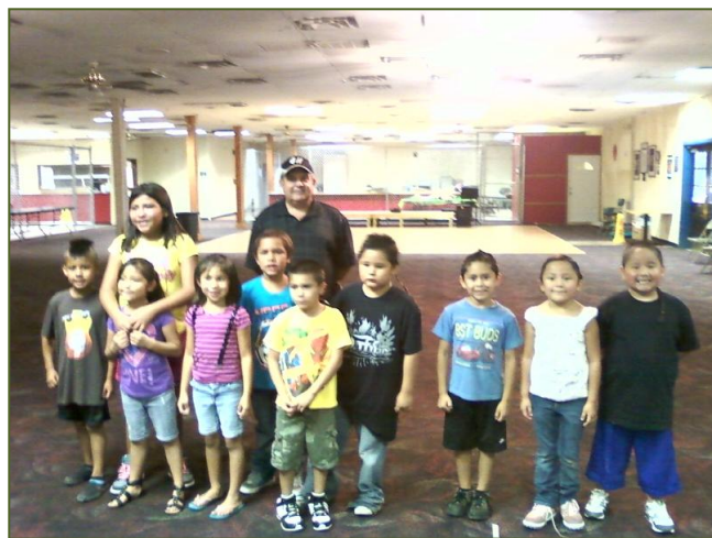
The County Extension Agent and some Kickapoo Indian youth