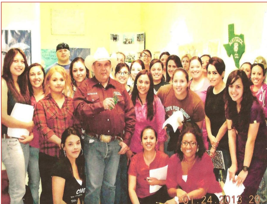
South West Texas Junior College Biology Students and the Maverick County Extension Agent

The Maverick County Extension Office is committed to continuously assist the community with the different needs in agricultural education, not only for the 4-H members but other educational institutions that require this kind of presentation.