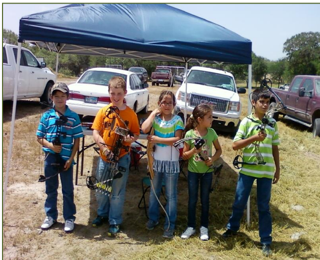
The Maverick County 4-H Archery Team That Competed in District 12