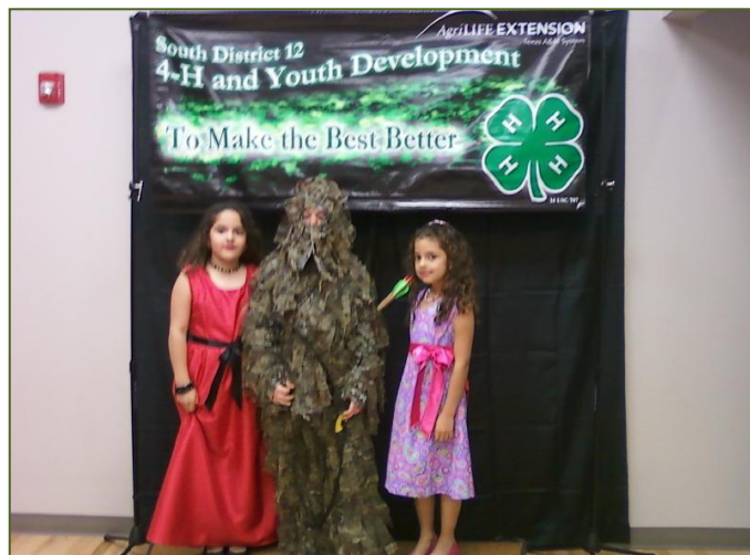
Participants of the District 12 Fashion Show