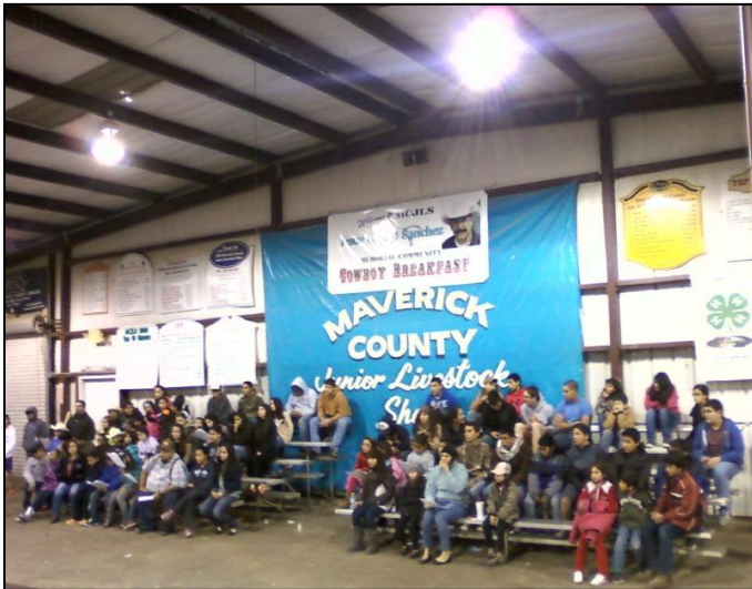
The Eagle Pass 4-H Club