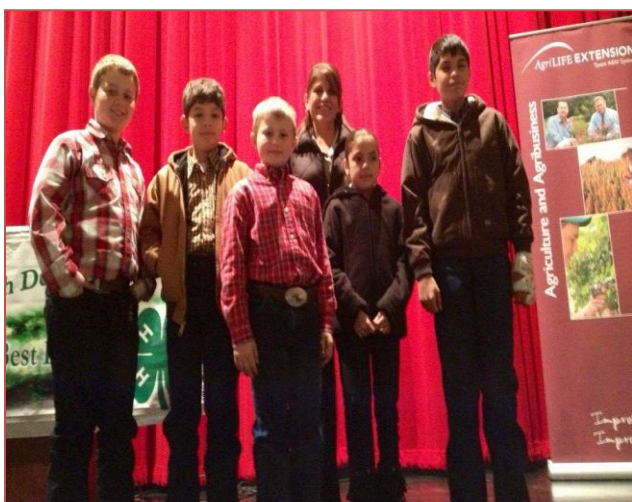
Participants of the District 12 Food Show