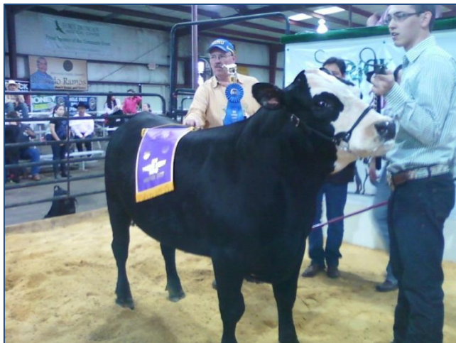
2013 Steer Grand Champion and a 4-H member