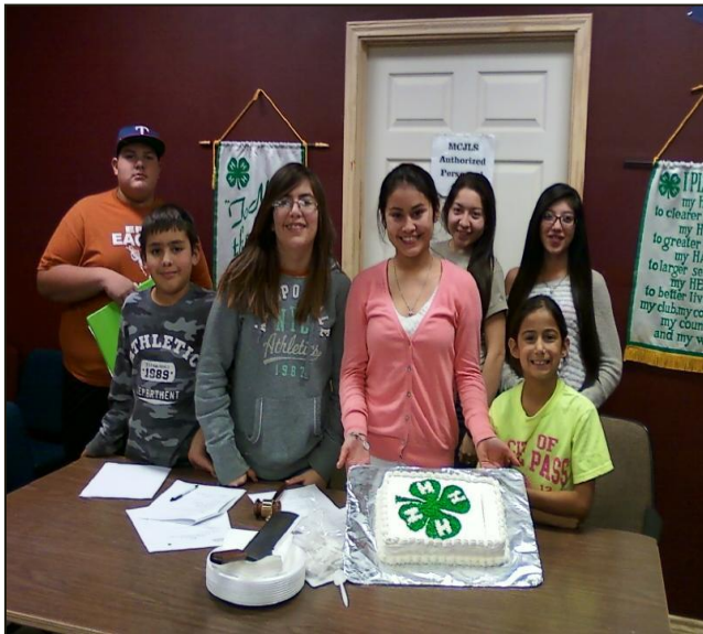
The 4-H Council of Maverick County

The Maverick County Extension Office will continue providing trainings in Parliamentary Procedures to the 4-H Council members, also to 4-H kids that seek leadership in the 4-H Council. Our plans for next year are to attend the District 12 Leadership LAB, and Election Convention.