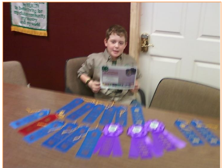
District 12 4-H Photography Contestant