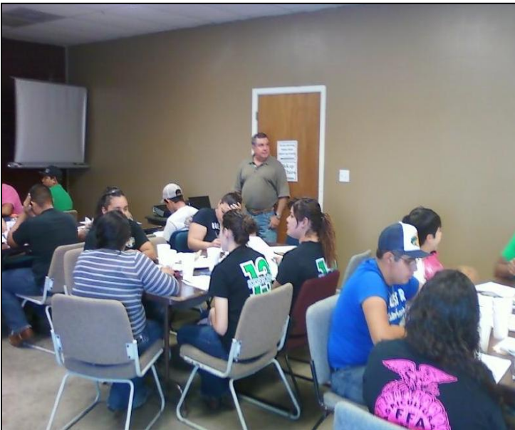
The Maverick County Extension Agent during the Pesticide Applicators Training to the High School Students.

The Maverick County Extension Office will continue providing agricultural education to the community, which includes Pesticide Applicators Trainings, CEUs, Webinars, and Workshops.