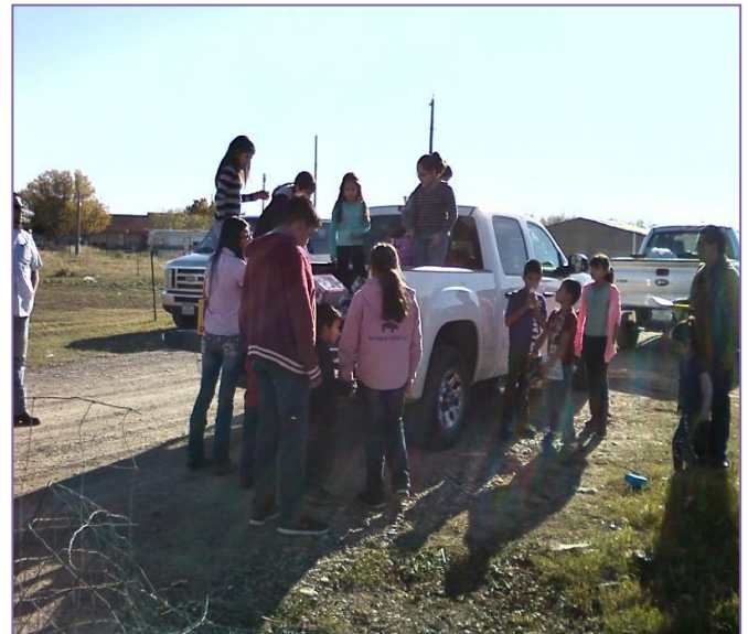
4-H kids delivering Christmas toys