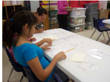
Benavides Elementary School