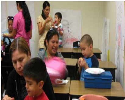
Brownsville Literacy Center

Brownsville Literacy Center has given me the opportunity to work with many limited resource Adults thought out the year. I was also given the opportunity to work with a group of limited resource female parents & their kids together I presented BLT sessions on the Back 2 Basics curriculum along with a healthy recipe in which the parents & the child were able to make together.