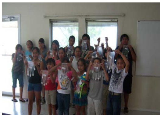
Los Fresnos "Nutrition in the Garden"