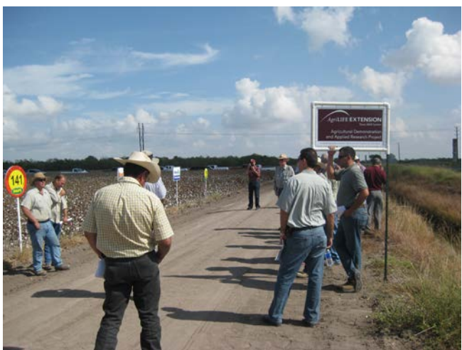
Cotton/Grain Sorghum Field Day