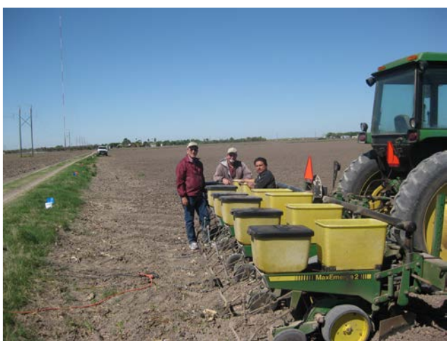
Planting of Cotton and Grain Sorghum RD