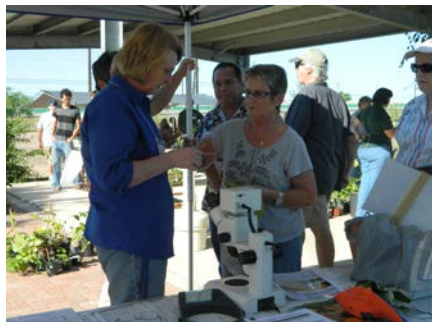
Plant and Insect Clinic