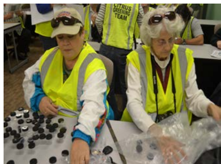
Citrus Greening Team