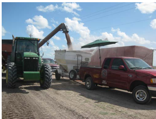
Harvesting Grain Sorghum RD