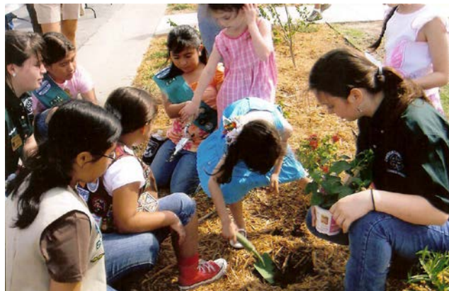
Cameron County 4-H member demonstrating proper planting techniques

Results: Students learned about the importance being good stewards of the land while also learning about establishing a vegetable garden. Students were administered a pre-program questionnaire in which they had an average of -5.1 or 53% of the questions wrong. Students were then given an identical post program questionnaire at the conclusion of programming. In the post-program questionnaire, students averaged -2.1 or 15% of the questions wrong. In addition, in the pre-program questionnaire, no one answered all the questions correctly and three students got all the questions wrong. In the post-program questionnaire, six students answered all the questions correctly and 100% of the students answered at least some of the questions correctly. Parents and administrators asked questions about starting a 4-H club after programming was concluded. We informed the clientele at Hope Farms that we would definitely continue to conduct educational programs at this location and would support the start of a 4-H club at this location.