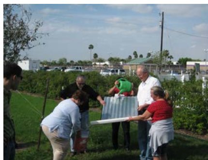
Master Gardener Class