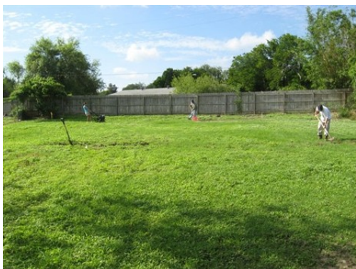
St. Mary's Garden 2011