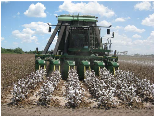
Cotton Result Demonstration

Future Plans: Continue soil testing campaign, contingent upon funding and continue important hybrid trials for the major crops. Conduct guar variety trials in cooperation with Rio Farms, Inc., local producers and private industry.