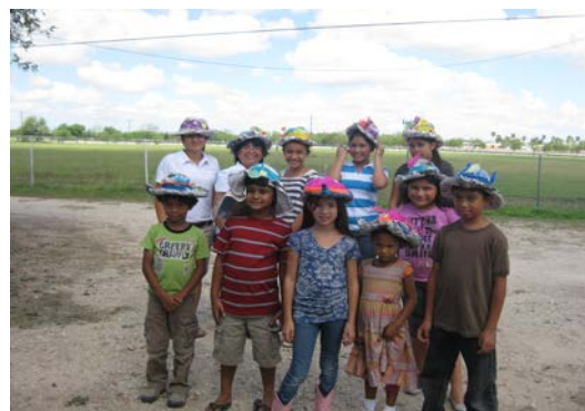
H.O.P.E. House "Nutrition In The Garden"