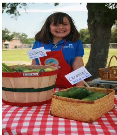
2012 St. Mary's Farmer's Market