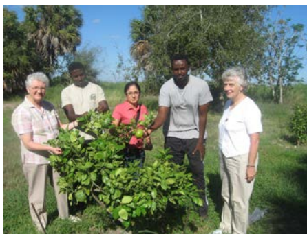
La Posada Citrus Program