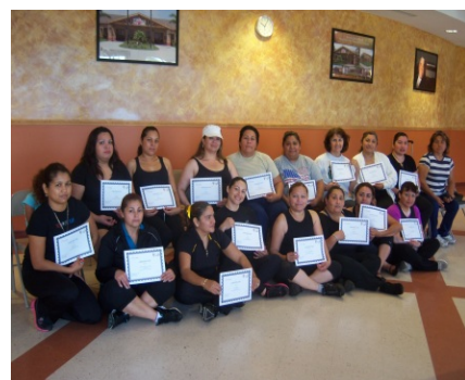
Brownsville Community Center