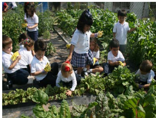
St. Mary's Garden 2012