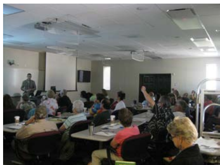
Do it yourself Rain Water Harvesting Program