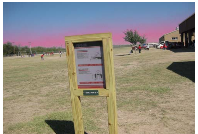
Signs for Obstacle Course