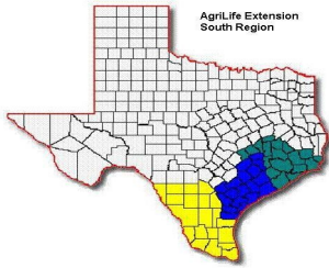
AgriLife Extension South Region