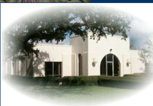
THE TEXAS A&M UNIVERSITY SYSTEM AGRICULTURAL RESEARCH & EXTENSION CENTER AT WESLACO