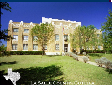
LA SALLE COUNTY - COTULLA