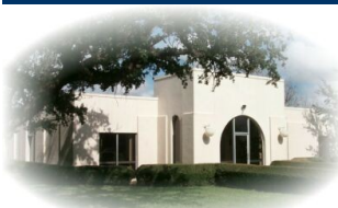
THE TEXAS A&M UNIVERSITY SYSTEM AGRICULTURAL RESEARCH & EXTENSION CENTER AT WESLACO

With over 100,000 acres of land burned in wildfires in January and March of 2008, some programming efforts were cancelled or will be rescheduled for 2009.