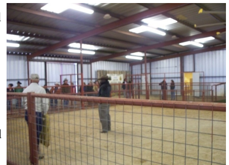
2009 La Salle County Livestock Show

In the 2007-2008 4-H year we had one of the highest enrollment numbers for the county. Enrollment for the 2008-2009 is off to a good start. Youth continue to participate in livestock projects with assistance from the County Extension Agent. The photography project group has grown in the amount of youth participating and the horse project group continues to increase in numbers. This past year, we implemented the public speaking and educational presentations portion of the 4-H program. We had two members compete at the District 12 4-H Roundup and both placed first in their divisions. The senior member, Matt Kinsel advanced to state competition with his persuasive speech on the Iraqi War. Matt placed 2nd overall in the public speaking competition at the State 4-H Roundup held in College Station in June. Matt Kinsel was also elected as the District 12 4-H Council 2nd Vice President this summer and was selected to serve on the State 4-H Technology Team. Monthly 4-H meetings and one-on-one trainings continue to be the most effective programming efforts provided by the County Extension Office.