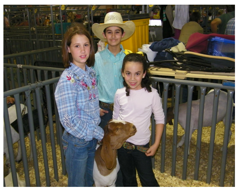
Jim Hogg County exhibitors at San Antonio Livestock Exposition

In 2008, the 4H program of Jim Hogg County consisted of one club with approximately 30 members and 8 registered adult leaders. Members participated in a number of different projects including: Food and Nutrition, Beef, Lambs, Swine and Goats. Shooting Sports was introduced for the first time in the form of the Archery project.