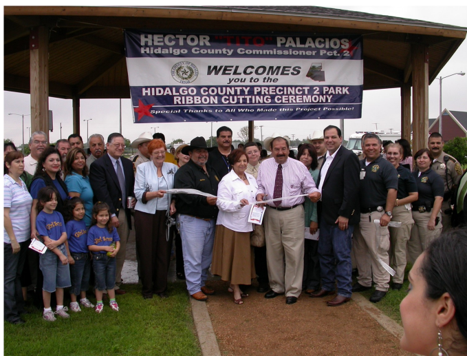
Extension assists county with San Juan Park Project

2008 Highlights: Currently there are over 200 adult volunteers and 522 4-H'ers in Hidalgo County 4-H clubs. Through volunteers, agents and program assistants we reached a total of 26,078 youth through all 4-H programs conducted in 2008. 4-H volunteers donated 1,480 hours of their time and knowledge to local youth in 2008. They help manage local clubs, conduct youth trainings/clinics, and event judges. Our school curriculum is TEKS-aligned and aids the teachers of Hidalgo County. Our most successful curriculum enrichment is the Egg-to-Chick program where teachers actually hatch eggs in the classroom. Working closely with schools, many teachers are using a variety of different curriculums, including water conservation, wildlife, consumer education, and aquatic ecology. This year's teacher training , reached 38 teachers from 6 different school districts and 12 different campuses.