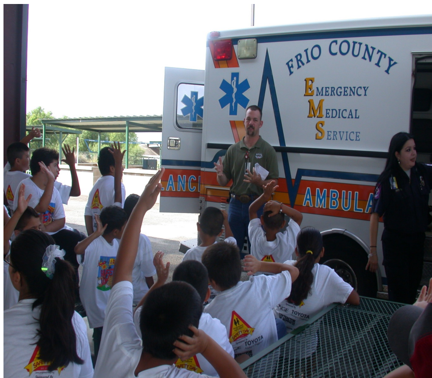
Frio County Farm Safety Day

The Frio County Youth Leadership Advisory Board sponsored the 2008 Frio County Safety Day on July 8, 2008. The program is also sponsored by an in-kind grant from the Progressive Agriculture Foundation. This year we had 59 youth and 30 volunteers attend the Safety Day. Local cooperators included: Medina Electric Cooperative, Texas Parks and Wildlife Biologists, and Game Wardens, Frio County Commissioners Court, City of Pearsall Police Department, Dilley Fire Department, Tractor City/ John Deere- Pearsall, Frio County EMS, Texas Department of Health- Pearsall, Frio County 4-H volunteers, and MHMR-Dilley. Topics that were covered by the volunteers included electrical safety, farm safety, first aid, gun safety, drug awareness, food safety, boat/water safety etc. Due to the success of the program, we have received funding for the 2009 and new and local agencies and organizations would like to get involved. We have also worked with Pearsall Intermediate to implement the Embryo Science school curriculum and have also implemented an educational series in the 4-H newsletter using the Patriotism through Preparedness Curriculum. Frio County 4-H program also consists of three community 4-H clubs with a total of 141 members and 80 volunteers. Clothing and Textiles, foods and nutrition and Food Safety educational programs continue to be offered to area youth through the 4-H program. Frio County was also involved in hosting the 2008 District 12 Food Show in George West.