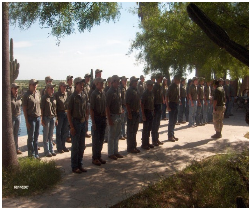
La Bandera Ranch was host to the South Texas Buckskin Brigade, a youth leadership camp focused on wildlife and natural resources.

Dimmit County 4-H continues to have involvement Most of the District 4-H Events. Currently we have 145 youth enrolled in the 3 4-H Clubs form 3rd grade to the ages of 19. With the addition on the Clover Kid Program, 25 younger members are waiting in the wings to become regular 4-H members. The Dimmit County Jr. Livestock Show allowed clover kids the opportunity to showcase a rabbit project at our local county fair, and all of the youth are honored for their hard work with a plaque. The number of youths continue to increase, and thus our enrolment is increasing with new members. Also, 20 youth took part in a program entitled quality counts that taught youth the importance of the red meat market and character education. Youth learned proper locations on to which shots were to be placed, along with how to read a medicine label, and the impotence of following the label. This six week course taught youth the importance of Respect, Responsibility, Citizenship, Caring, Fairness, and Trust, as it relates to both their livestock and themselves. Youth were given a pre and post test to determine knowledge gained where as a 40% increase in knowledge was seen in scores pre verses post.