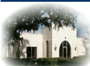
THE TEXAS A&M UNIVERSITY SYSTEM AGRICULTURAL RESEARCH & EXTENSION CENTER AT WESLACO

Dimmit, Zavala, Maverick and Frio Counties partnered together to provide valuable training to packing shed food handlers in the form of sanitation, and cleanliness in an attempt to get them GAPS Certified. This certification will allow packing sheds the opportunity to market their food products to retailers that would otherwise not purchase their food items due to food safety practices. Individuals were provided training in either English or Spanish ( Depending on their fluencies) and given an exam to measure retention of the curriculum. All individuals past the exam and received their certification in Dimmit County for hygiene and sanitation.