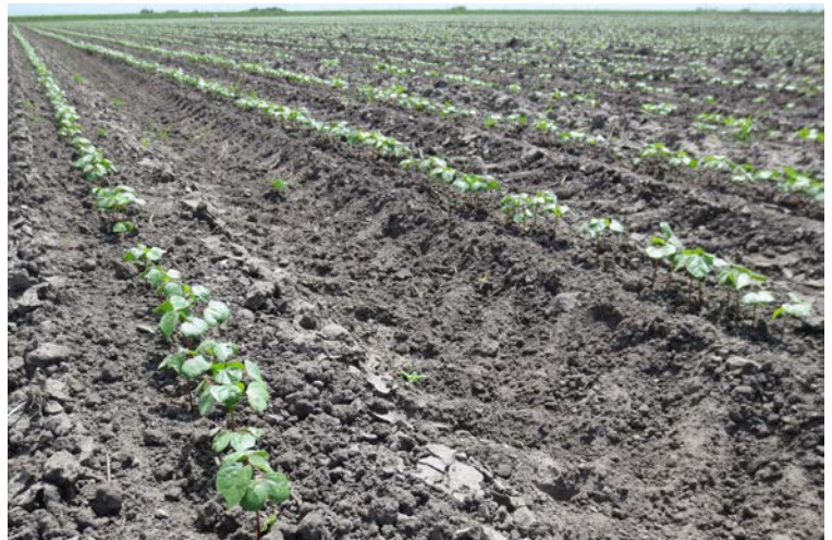
Figure 1: Cotton at 2 nd to 3 rd true leaf stage