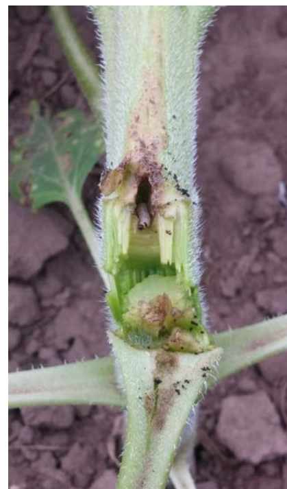
Sunflower bud moth in the middle of sunflower stalk feeding on inside

bud moth will lay its eggs near the petiole of plant. The larva of the sunflower bud moth has a dark brown head with a segmented cream colored body and is a little less than a half inch in size. The larva then tunnels into the plant leaving a large amount of black frass exuding at the entrance hole. There are two generations; the first generation they develop on germinating wild sunflowers and feed on early planted varieties of sunflowers in their vegetative growing state. The second generation feeds on the germinating head. Sunflower bud moths are a rare occurrence and usually cause limited damage to fields. Since the larva feeds in the plant stalk insecticide control is ineffective and NOT recommended.