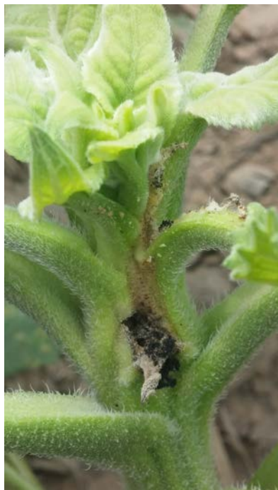
Black frass is an indicator of where the sunflower bud moth entered the sunflower