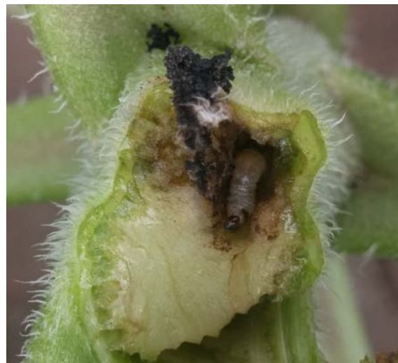
Sunflower bud moth feeding inside sunflower stalk

Sunflower stands continue to look great. In the McCook area we are seeing some sunflower bud moth larvae, Suleima helianthana (Lepidoptera: Tortricidae) in a couple of fields. The sunflower bud moth adult is about half an inch long with 2 distinct dark transverse markings on its forewings. The adult