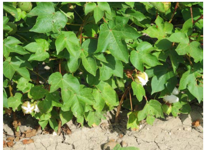
Cotton with open bolls

Cotton is maturing well as this week we are seeing many more white blooms at the tops of the canopy as we reach cutoff. This week we observed the first open bolls in cotton. We noticed about 10% of open bolls in cotton fields around the Valley. The main pest of concern this week that was being observed feeding on cotton is the Verde plant bug, Creontiades signatus . Cotton fields east of Rio Hondo, in San Perlita and around the Willamar area were treated this week for Verde bugs. Verde bugs were also observed in fields along the river heading west but in very low numbers. Verde plant bug adults are about ¼ inch long in size and are light green in color with long antennae and red eyes. Verde plant bugs feed on squares and small to medium