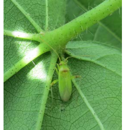
Adult Verde plant bug

Harvest continues this week. Grain yields are averaging anywhere from 4500 lbs. to 6500 lbs. /acre. Both grain and corn fields are drying up and getting ready for harvest as we finish this season.