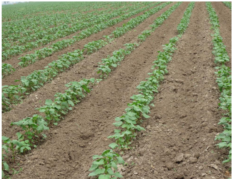
Figure 1: Valley Cotton

As I drove around the Valley scouting this week and last I noticed a lot more cotton coming up. Majority of the Valley's cotton is at cotyledon stage but there were several fields planted early that are already producing pinhead to ¼ grown squares and up to 9 true leaves. Much acreage has already been planted but there are still some growers planting cotton. According to the Texas Boll Weevil Eradication Foundation (TBWEF) there will be anywhere from about 120,000 to 150,000 acres of cotton for the 2016 year. That's more than double what was planted last year which is great to see us back to our normal cotton acreage! Tamaulipas Mexico also seems to be having a normal year with cotton acreage planted this year at 3100 hectares (7660 acres). The past couple of weeks we had some really strong wind gusts at 30 mph that caused some cotton seedlings that were just coming up to have to be replanted from all the sand blasting. Pest activity is very minimal right now in cotton as we are seeing a few thrips and a couple of cotton aphids here and there in the cotton.