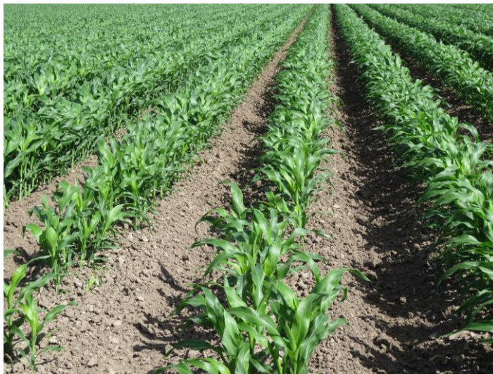
Figure 2: Valley Grain Sorghum

We are currently scouting 12 commercial sorghum fields throughout all three counties. We have been looking for sugarcane aphids and they have been hard to find. We found a few (<10 sca/leaf) in some Johnson grass in Cameron, Hidalgo and Willacy counties but none so far in the commercial sorghum. I did however come across some volunteer sorghum this week in the Donna area and saw for the first time this growing season high sugarcane aphid numbers (> 1000 sca/leaf). However I just want to point out that you all (growers) have really made sure your